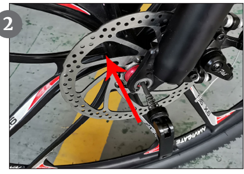
The front fork is aligned to both ends of the bearing. The disc brake is on the left