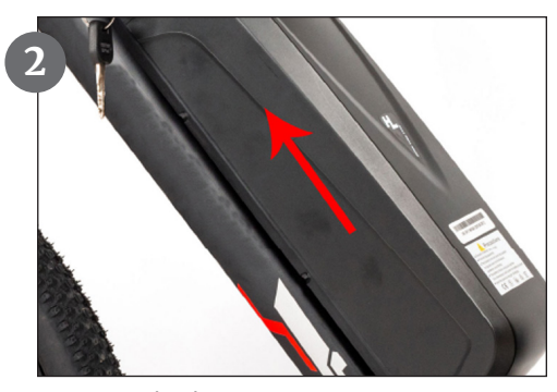
Remove the battery