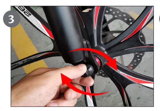
Install the quick release and nut then tighten well