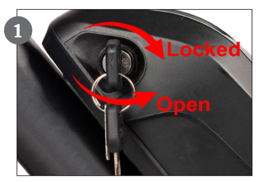
Open the battery key