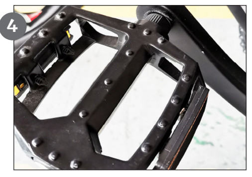
Tighten the nuts counterclockwise