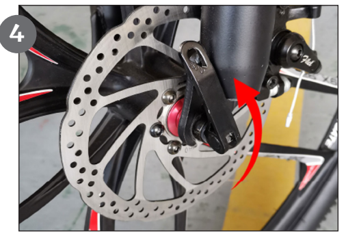
Twist the wrench upward and check the operation of the wheel