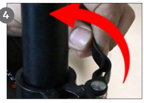
Finally lock the folding mechanism