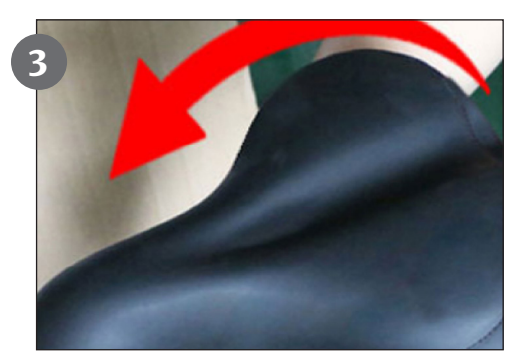
Adjust and rotate the seat