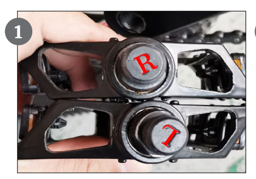
Please check the L and R marks on pedals