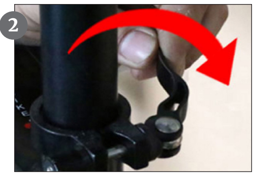
Open the folder of the seat tube