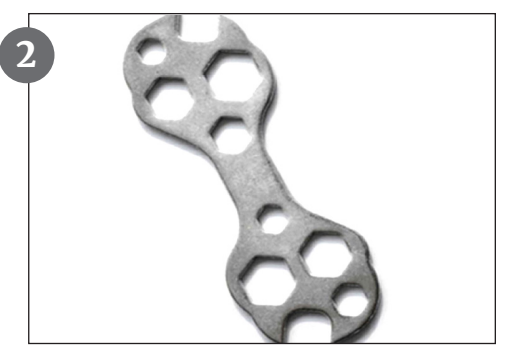
Take the wrench from the tool box