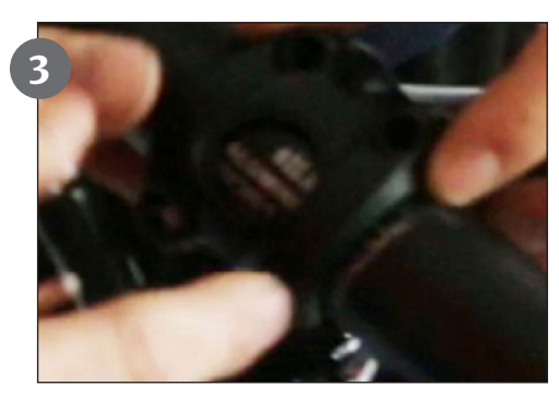
Fasten the handlebar